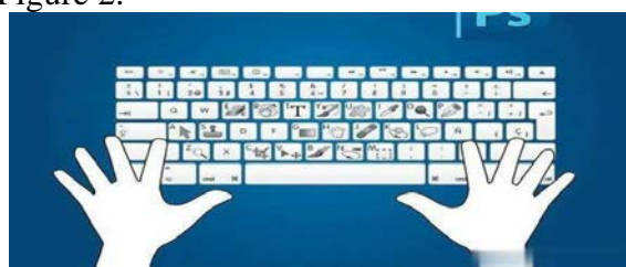
Figure 2 Basic structure of software design

In the design of sensor network node network, it can be composed of the following three parts: communication protocol system, routing protocol system and embedded operating system. It can also be summed up in two parts, one being system-oriented. the other part is customer-oriented layer. specific as shown in Figure 2.