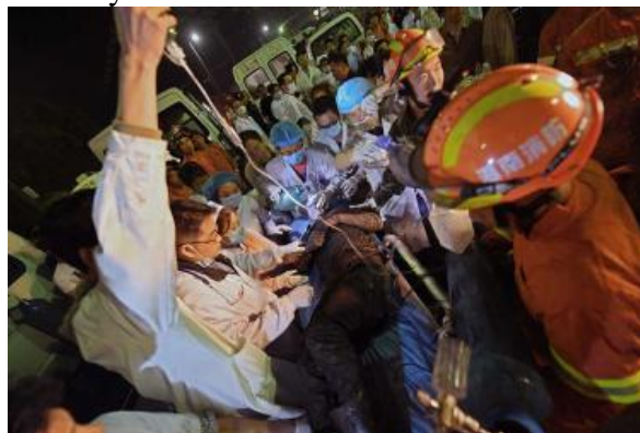
Figure 1 Hunan coal mine safety accident first aid scene

The coal industry is dangerous and complex, so it is necessary for the workers to go deep into the mine to carry out the construction, and the dust, environment, top pressure and fire in the underground environment will threaten the life safety of the workers. As a leading coal-producing country in the world, coal safety incidents occur frequently in recent years, as shown in figure 1, which is the first aid scene of fire in coal mining industry in hunan. caused widespread concern of the community. In response to this problem, the coal industry needs to take measures to strengthen prevention. In order to fundamentally reduce the coal mine safety incidents, we need to fully understand the specific situation of the underground environment. Therefore, it has become the primary task of coal industry to supervise the coal mine safety system and improve the work safety under the mine[1]. In recent years, with the continuous progress of science and technology, wireless sensor network has been gradually applied to coal mine safety detection, and the detection effect is accurate and reliable, which not only effectively reduces coal mine safety accidents, but also improves the efficiency and level of coal mine operation in an all-round way, thus promoting the stable development of coal industry.